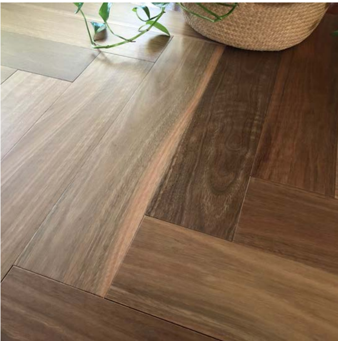
Australian Native Herringbone - Spotted Gum

"Installing Australian Native Herringbone requires a high level of skill and Hurford's recommend only qualified tradespeople with the relevant skill levels undertake the installation."